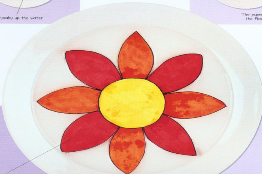
Eventually, the flower opens up completely